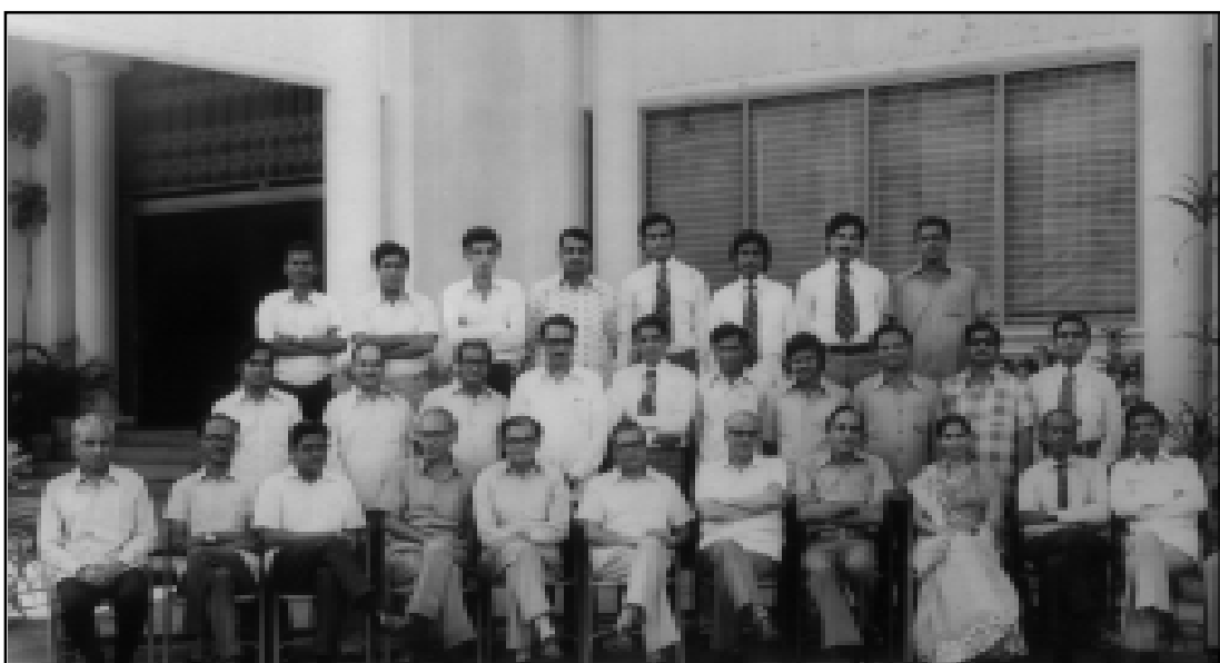
Group Photo of XXXV Training Course (DTO's) 7th Feb - 7th May 1977