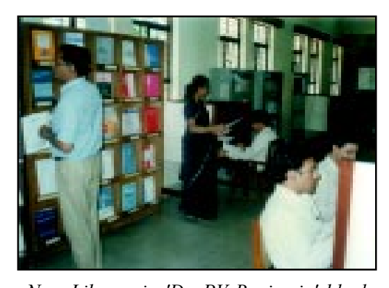
New Library in 'Dr. PV Benjamin' block

reach out. One thing it did on priority was the expansion of library facilities. By 1970, its annual budget was doubled to one lakh rupees and its floor area more than doubled. In addition to the regular services, the library started the following activities: current service, awareness indexing service, selective dissemination of information, compilation of mailing addresses, user education programmes and systematising information to different levels for e.g., programme supervisors, state TB demonstration and training centres, health institutions, academic institutions, functioning health centres, allied teaching and research institutions. The library and dissemination services rapidly became a cynosure for all the trainees, visitors and distinguished TB workers. In fact, its services contributed to the growth of the NTI by taking cues from contemporary events elsewhere and helpful to inform others.