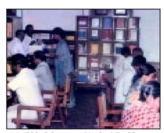
Old Library in 'Avalon' Building